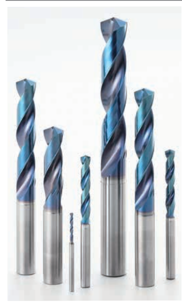
Carbide Drill "AquaRevo Drill"

We released the innovative carbide drill "AquaREVO drill," made with developed carbide materials, coating, and a newly -designed cutting edge.