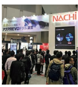
JIMTOF (Japan) November 2018

We establish factories with the latest robot and FA systems, and construct slim, flexible manufacturing systems.