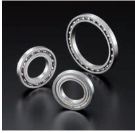
Thin-walled deep groove ball bearing for electric units

The electric actuator based on solenoid technology is available with a high-powered lock mechanism that contributes to electronic control of the powertrain.