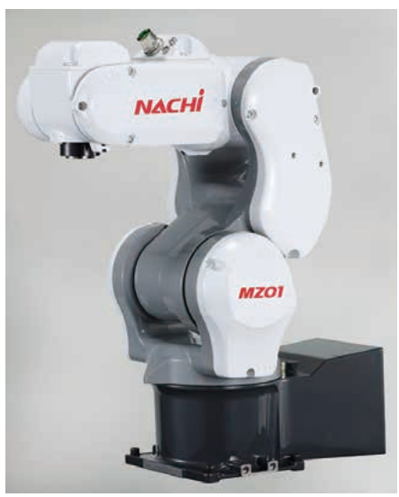
Compact Robot MZ01