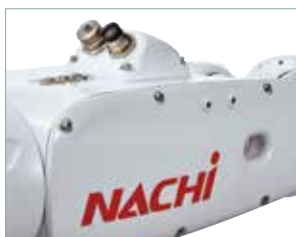
I/O 20 core, LAN 8 core 1 Line