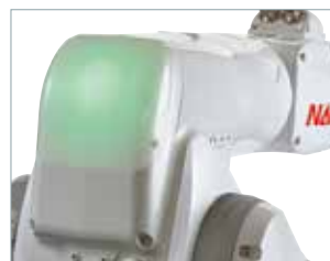
Collaborative mode indicator lamp