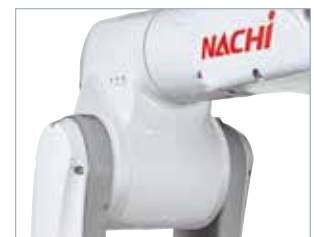
Offset shape that reduces the risk of getting caught