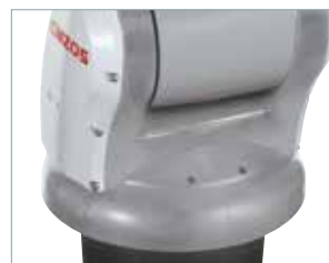
Stopper cover that reduces the risk of getting caught