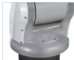
Stopper cover that reduces the risk of getting caught