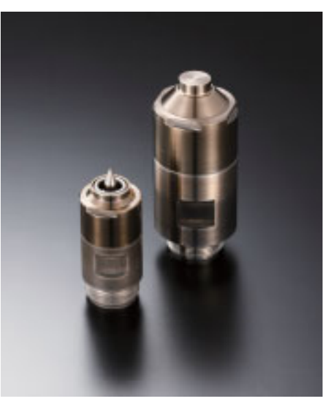
Nozzles of plastic injection molding machine