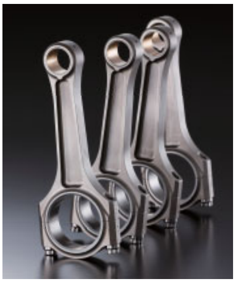
Parts for a formula car